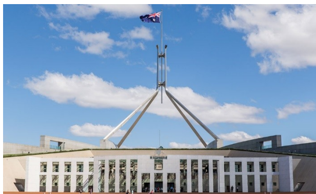
The Coronavirus has kept our Federal Government very busy.

The Coronavirus has led to an unprecedented response from the Commonwealth Government in the form of stimulus. In the section below on the sharemarket, we discuss the historical basis for government stimulus at times of economic downturn. In this section, we thought we should start this month's newsletter with a recap of Commonwealth Government stimulus payments (yes, they are technically known as stimuli).