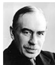
John Maynard Keynes

Many of the lessons that are being applied in Australia in the 21 st century spring from the experiences of world economies during the Great Depression described above. Perhaps the most vital set of learnings from the Great Depression came from the mind of John Maynard Keynes, a British economist. Using the knowledge that there are two broad sectors within a capitalist economy – the public sector (that is, Government) and the private sector (that is, everything except the Government), Keynes identified that there are periods within the economic cycle when the Government sector needs to take the lead. These periods were times of relatively low private sector activity, which were typically times when the economy as a whole was either slowing down or contracting. During these times, the profit-seeking private sector could not really be expected to increase investment and employment – two things that need to happen for an economy to recover and growth to recommence.