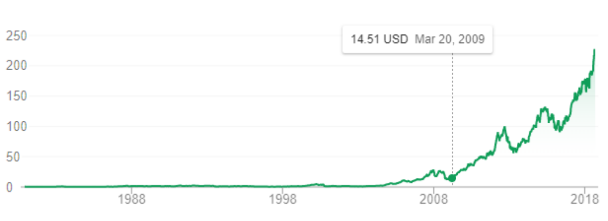
Apple Shares Since Formation

In August, Apple became the first company whose total shares were valued at more than US $1 trillion. If you want to see the impact of these tech giants on the American market, consider this graph showing the lifelong sharemarket performance of Apple shares. Once again, the source is Google: