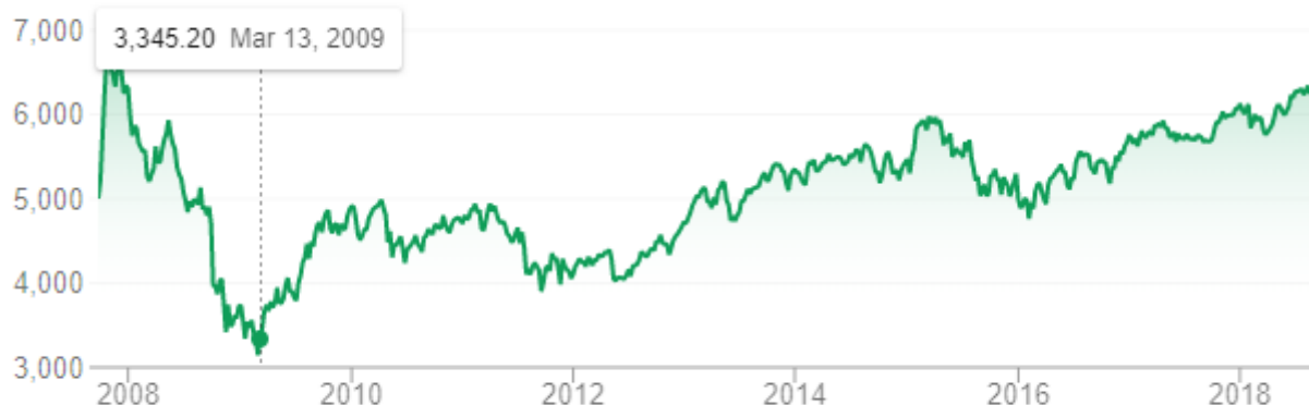
ASX 200 Ten Years to 2018

growth enjoyed by U.S.-based investors. In fact, the average U.S.-based investor has done four times better than the average Australian-based investor. Here is how things looked in Australia: